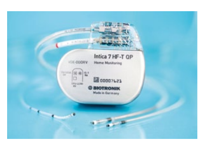
Neues CRT-D Implantat Intica 7 HF-T QP von Biotronik