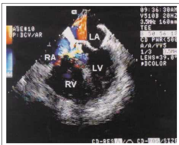
Figure 1. Transoesophageal echocardiography demonstrates dilated right atrium (RA) and right ventricle (RV) and a high velocity shunt from aorta to right atrium. LA = left atrium, LV = left ventricle

aneurysm. His cardiac examination was remarkable for sinus tachycardia and presence of a 3/6 continuous murmur, louder during systole at the left sternal border. The patient underwent transoesophageal echocardiography, which revealed ruptured right sinus of Valsalva, dilated right-sided cardiac chambers, and bicuspid aortic valve (Fig. 1). Color flow mapping revealed evidence of a high velocity shunt from aorta to right atrium. Aortography and cardiac catheterization were performed which demonstrated presence of a fistula from aorta to the right atrium with left to right shunt (Fig. 2). The coronary arteries were free of obstruction, and aortic valve was competent. Mean right atrial pressure was 25 mmHg, right ventricular pressure 65/15 mmHg, pulmonary arterial pressure 64/35 mmHg, and mean pulmonary capillary wedge pressure 30 mmHg. The oxygen saturation in superior vena cava was 55 % and that in right atrium 77 % with a step-up of 22 %. The pulmonary to systemic circulation ratio (qP/qS)