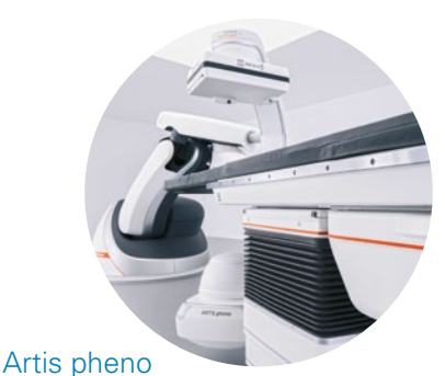
Siemens Healthcare Diagnostics GmbH