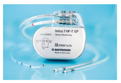
Neues CRT-D Implantat Intica 7 HF-T QP von Biotronik