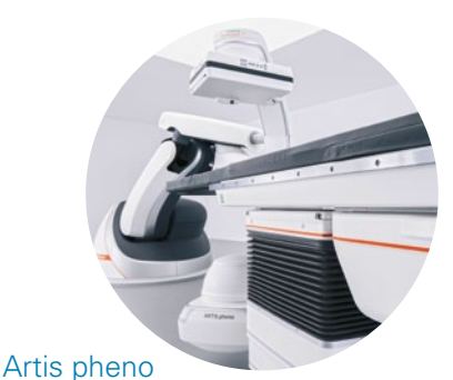
Siemens Healthcare Diagnostics GmbH