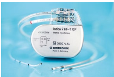
Neues CRTD Implantat Intica 7 HF-T QP von Biotronik