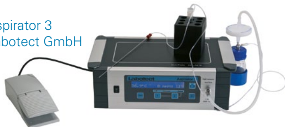
Aspirator 3 Labotect GmbH