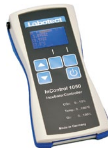
InControl 1050 Labotect GmbH