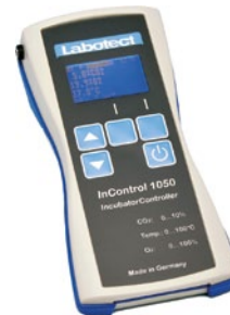
InControl 1050 Labotect GmbH