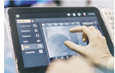
Philips Azurion: Innovative Bildgebungslösung