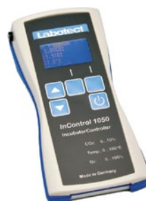
InControl 1050 Labotect GmbH