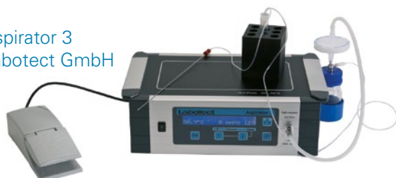
Aspirator 3 Labotect GmbH